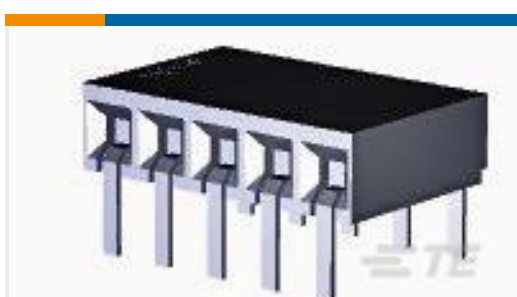
TE Part # 5535676-4 05 MODII HORZ SR CE 100CL